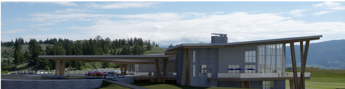
NW Ground Level Perspective View