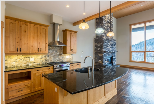
Gorgeous kitchen with Alder cabinets, marble countertops, and a cast iron undermount sink.