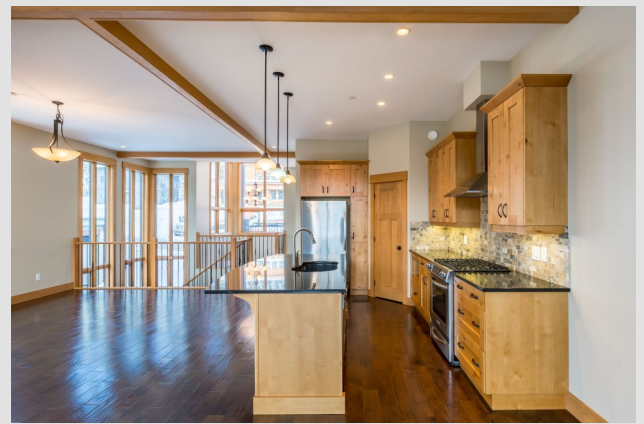
Bright, open plan with gleaming engineered hardwood floors.