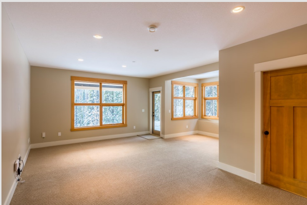
Family room is a huge area adaptable to a wide variety of uses. French door to the covered patio.