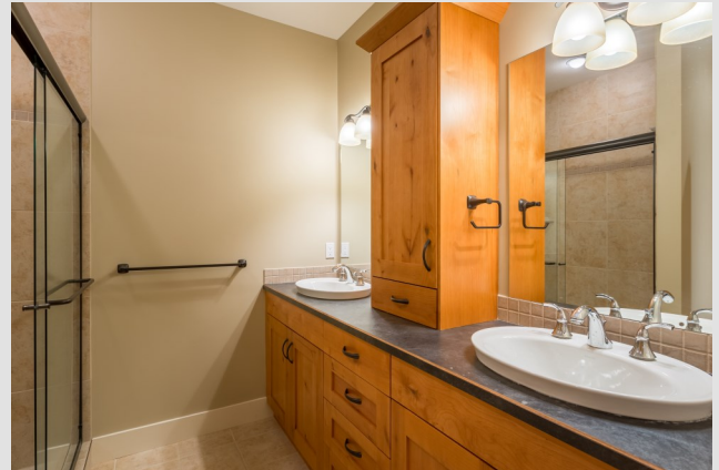
Main bath has an oversized tile shower, dual raised sinks, and a tile floor.