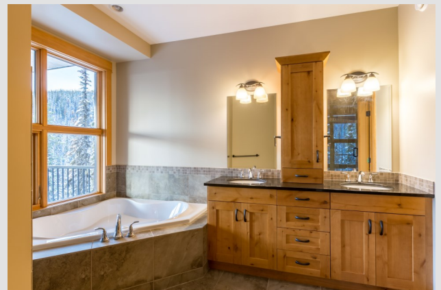
Ensuite with a jetted soaker tub, heated tile floor, and a water closet for privacy.