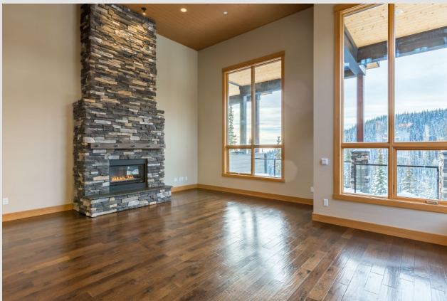
Floor to ceiling natural gas rock fireplace with accent lights.