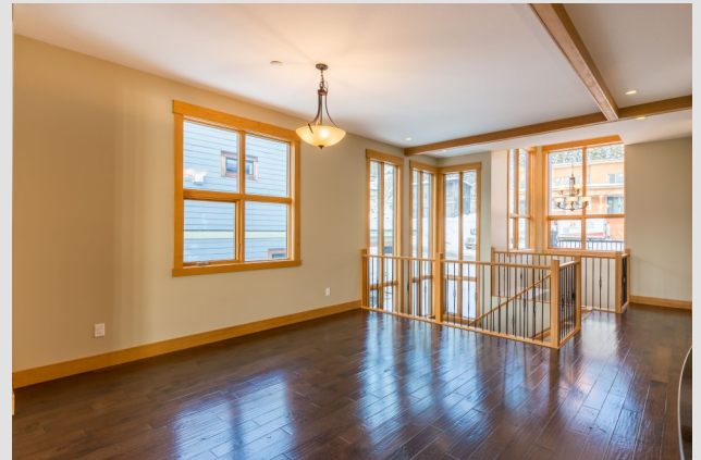
Ample natural light with warm and welcoming colours on the freshly painted walls.