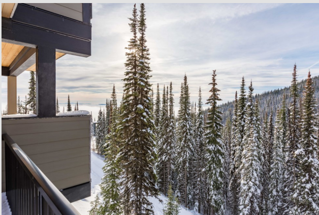
Expansive views of the mountain and valley from the decks and home.