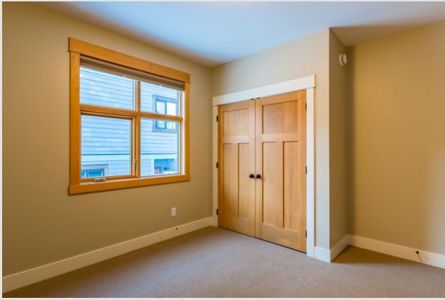
Second bedroom with natural wood accents and wall to wall carpet for comfort and warmth.