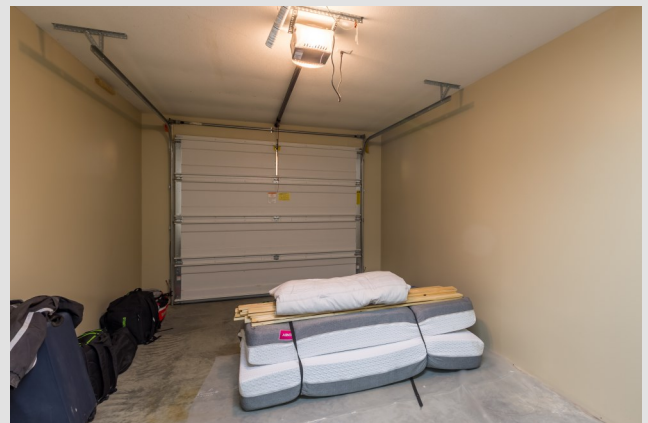
Attached garage is a huge bonus at a ski resort home. Drywalled and painted.