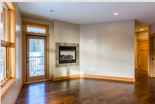
Master bedroom features a see through natural gas fireplace to the ensuite.