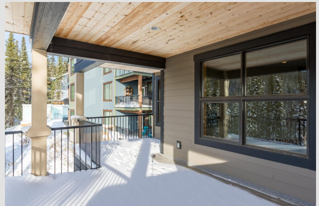
One of three decks to enjoy the fresh mountain air.